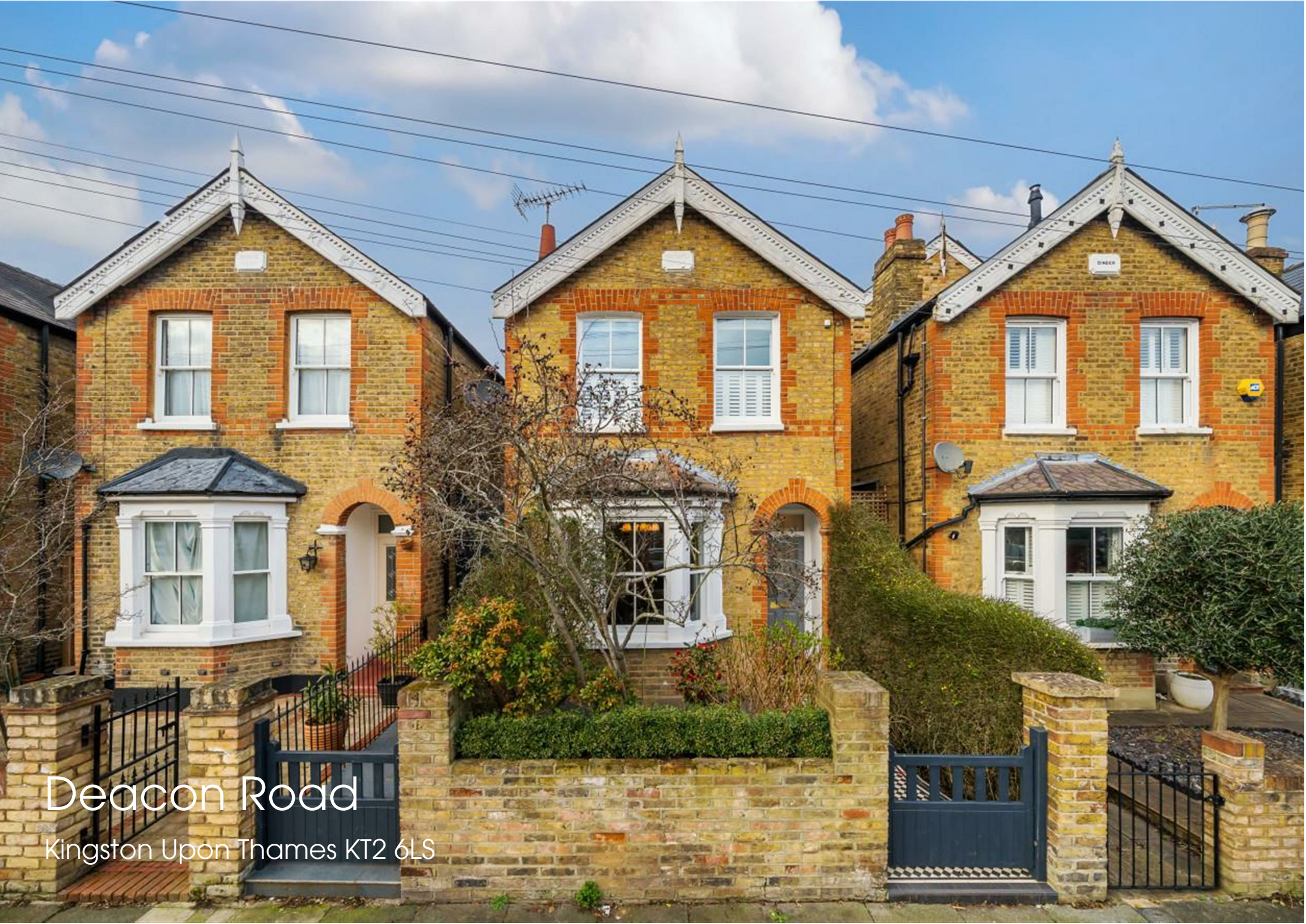
Deacon Road Kingston Upon Thames KT2 6LS